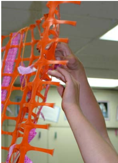
1. Weaving on a Fence (cooperative work)

Weaving ideas and adaptations can include changing materials used for the warp and weft of traditional weaving. A quiet weaving station can be a motivator for students. At the end of the school year students can “unweave” their work. Many students enjoy this process just as creating the weaving.