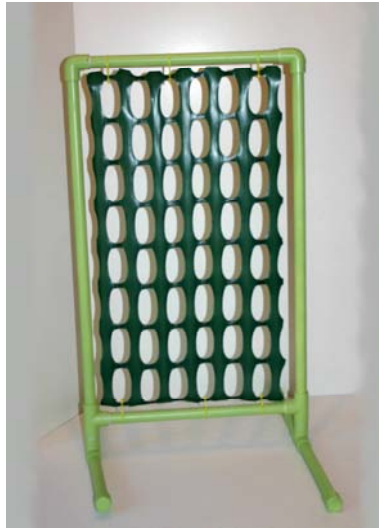
Installation of the weaving station:

* Check with your custodial staff before hanging anything to a ceiling. I have used ropes tied to ceiling hooks where the suspended ceiling has been reinforced. Since some students will pull on the weaving with force, they will need to be supervised when working at this station.