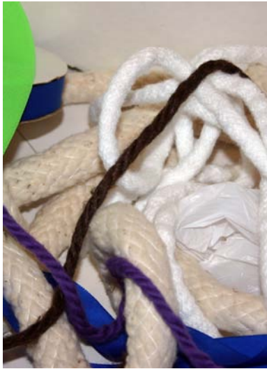
There are so many options for creative weavers.